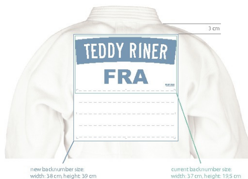
New back identification of athletes 01.01.2011

The bottom part consists of the Sponsor and the Name of the Event, which will be distributed during the accreditation.